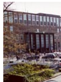
- Main Building - University of Cologne

Do you have any topics that you would like to investigate? Please contact us.